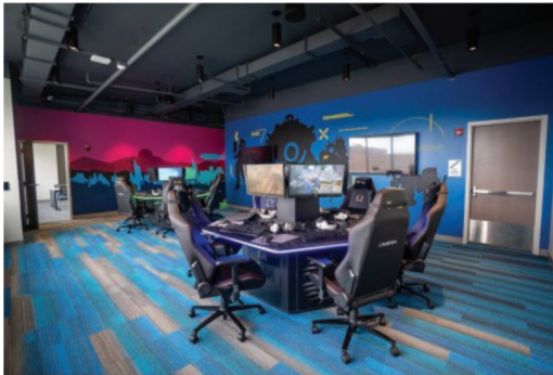
E-Sports Gaming Room