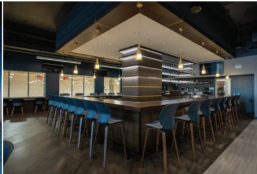
Restaurant/Bar Overlooking Courts